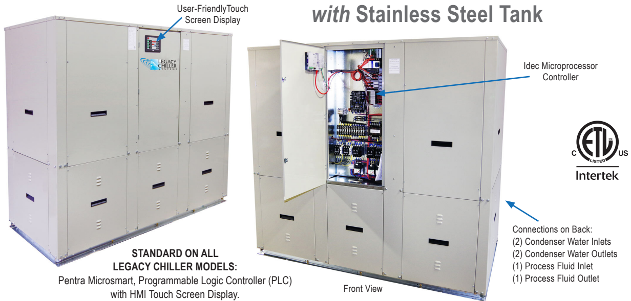
STANDARD ON ALL LEGACY CHILLER MODELS: Pentra Microsmart, Programmable Logic Controller (PLC) with HMI Touch Screen Display.

Legacy Chiller Systems 851 Tech Drive Telford, PA 18969 Toll-Free: (877) 988-5464