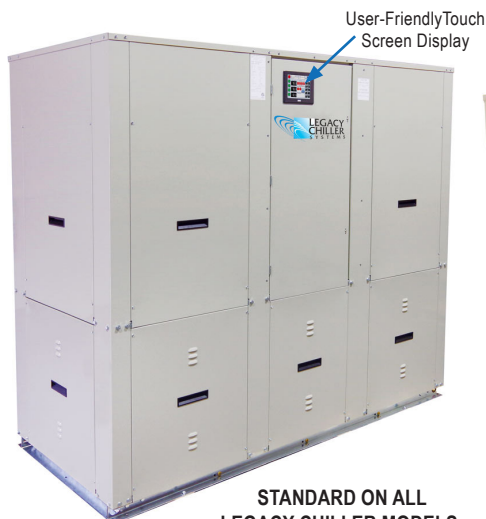
STANDARD ON ALL LEGACY CHILLER MODELS: Pentra Microsmart, Programmable Logic Controller (PLC) with HMI Touch Screen Display.

Legacy Chiller Systems 851 Tech Drive Telford, PA 18969 Toll-Free: (877) 988-5464