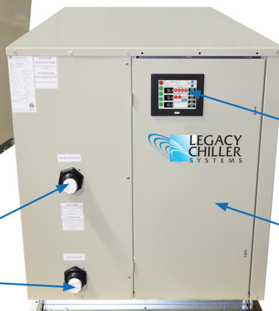
Process Fluid Inlet