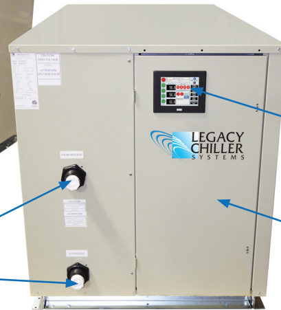
Process Fluid Inlet