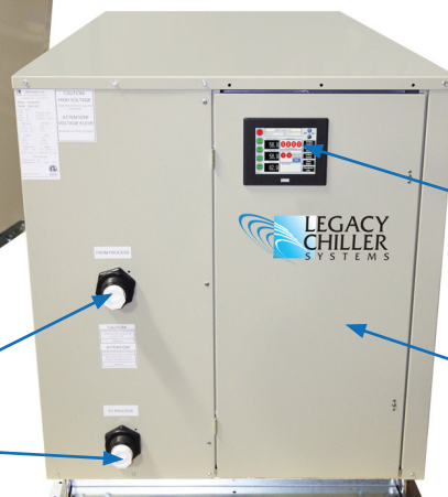
Process Fluid Inlet