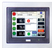
Easy to Use Touch Screen Display on all Legacy Chiller Models