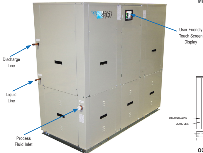
Condenser Model (OC11S)

STANDARD ON ALL LEGACY CHILLER MODELS: Pentra Microsmart, Programmable Logic Controller (PLC) with HMI Touch Screen Display.